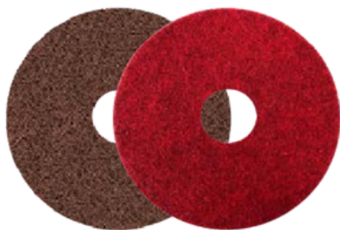
220 GRIT | 400 GRIT