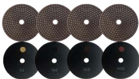
50 GRIT | 100 GRIT | 200 GRIT | 400 GRIT