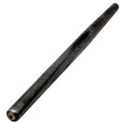
SDS PLUS PILOT GUIDE