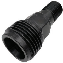
Hilti DD200 1/2" BSP BOX / 1/4" UNC PIN