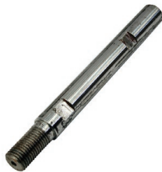
EXTENSION - 1/4" BOX TO PIN 300MM LONG