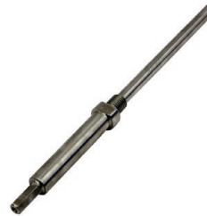
1/2" STRAIGHT SHANK WITH PILOT EXTENSION BY M16