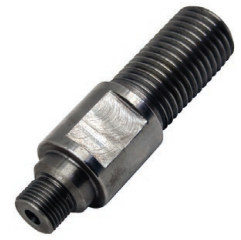
1/4" UNC PIN / 1/2" BSP BOX TO HILTI DD200