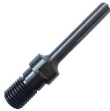
ADAPTOR (SDS PLUS) M16 ADAPTOR STRAIGHT SHANK M14