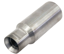
ADAPTOR - 1/4 BOX TO 1/2" BOX