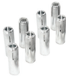
M12 DROP ANCHORS