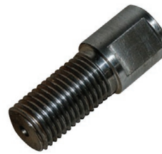
1/2" BSP BOX TO 1/4" UNC PIN ADAPTOR