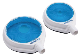
WATER COLLECTING RINGS