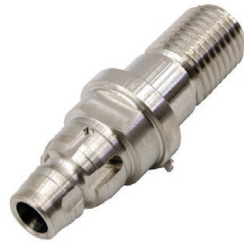
HILTI DD100 / 130 1/2" BSP BOX / 1/4" UNC PIN