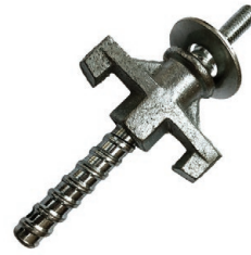
ANCHOR SETTING TOOL