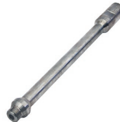
1/2" BSP BOX TO PIN 300MM LONG EXTENSION ROD